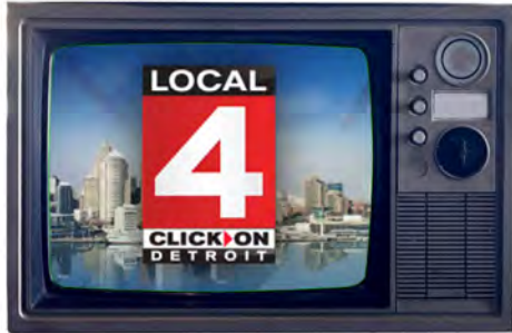
July 2023 Moosejaw Meal Kit Event