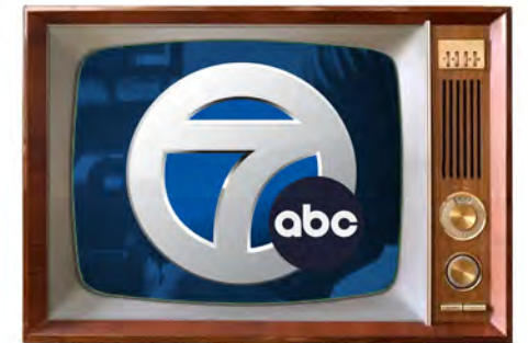
March 2023 Vibe Truck Sponsor Event