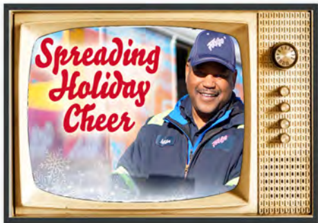
December 2023 Faygo Holiday Commercial