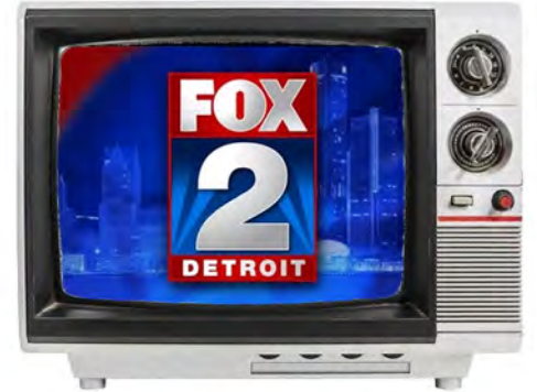
November 2023 SDM2 Collaboration