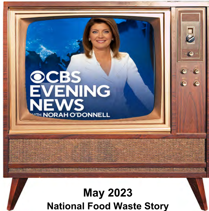
May 2023 National Food Waste Story